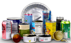
Food and Beverage Cans empty and rinse