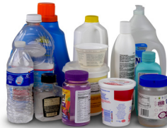
Bottles, Jars, Jugs and Tubs empty and replace cap