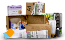
Mixed Paper, Newspaper, Magazines, Boxes empty and flatten